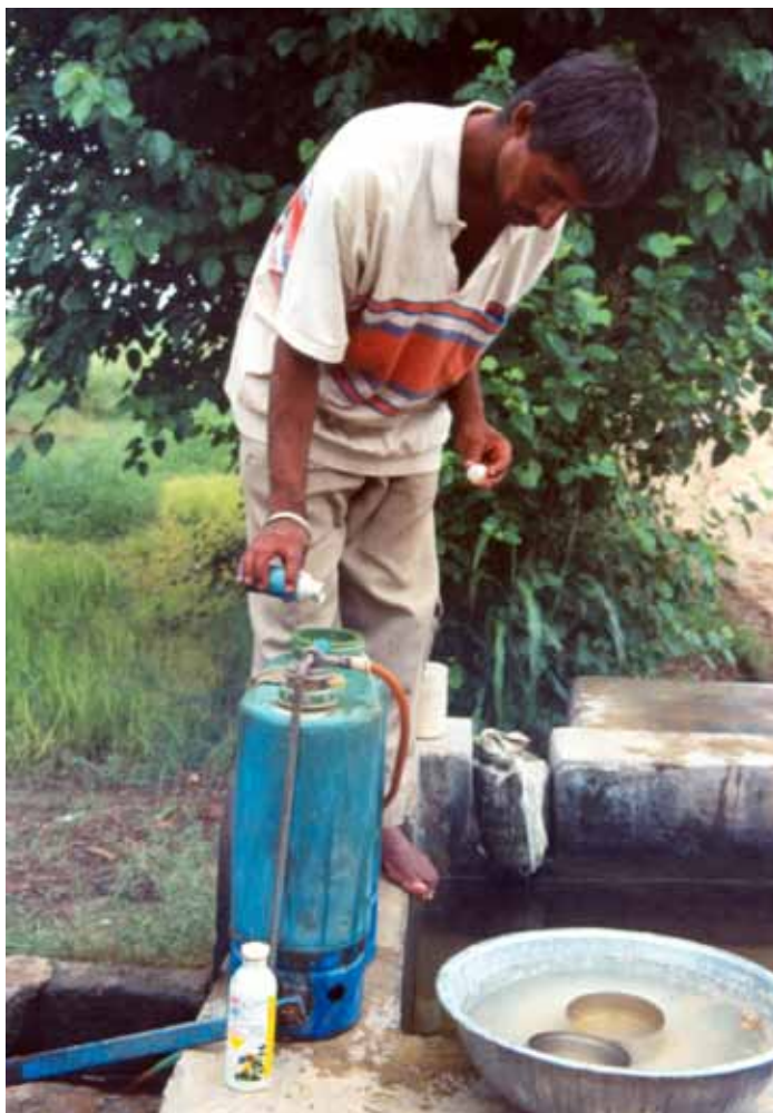
Preparing to spray pesticides in India

Public interest NGOs have also developed capacities to undertake new interventions to achieve SAICM goals. Some NGOs also have access to resources to carry out activities on SAICM issues. The activities of public interest NGOs have helped communities and other stakeholders such as health professionals, media, and academics to access new information and create awareness on SAICM issues. Networks have been set up among public interest NGOs and other stakeholders to exchange information. Information sharing and exchange between the public interest NGOs of the North and South have helped to build confidence among NGOs in the region.