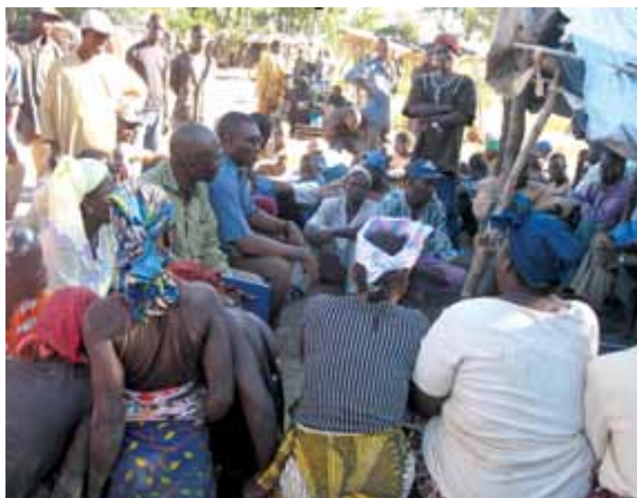
Fondation pour le Développement au Sahel staff interviewing small-scale gold miners in Mali to assess mercury use and exposure, and to educate them about the dangers of mercury use in gold mining.

as it relates to small scale gold mining. 1 In addition, PAN Mali also participates in the National Commission for Management of Chemicals, which addresses management activities of hazardous pesticides in Mali.