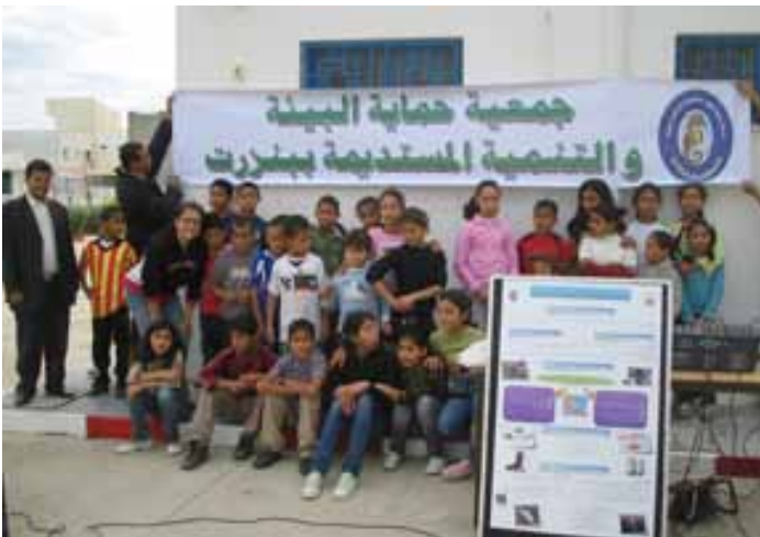
Youth mercury awareness workshop, organized by APEDDUB, Tunisia

People are slowly starting to be more aware of the harm of toxics. For example, numerous NGOs in the region (in Egypt, Jordan, Lebanon, Morocco, Tunisia, and Syria) have carried out awareness-raising activities on the health and environmental harms of mercury. In Tunisia, NGO AREMEDD (Association for Sustainable Development) carried out SAICM awareness-raising activities in eight states throughout the country, reaching 52 schools, 1,600 students, 450 educators, 37 NGOs, 300 women, and the media. In Syria, a workshop conducted with Al Akram Red Crescent Medical Center resulted in a signed statement