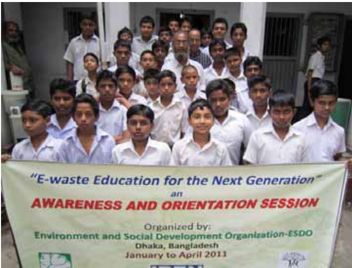
E-waste youth education session, organized by ESDO, Bangladesh