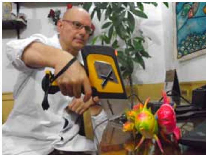
IPEN Technical Advisor testing childrens' products for toxic heavy metals with an XRF Analyzer