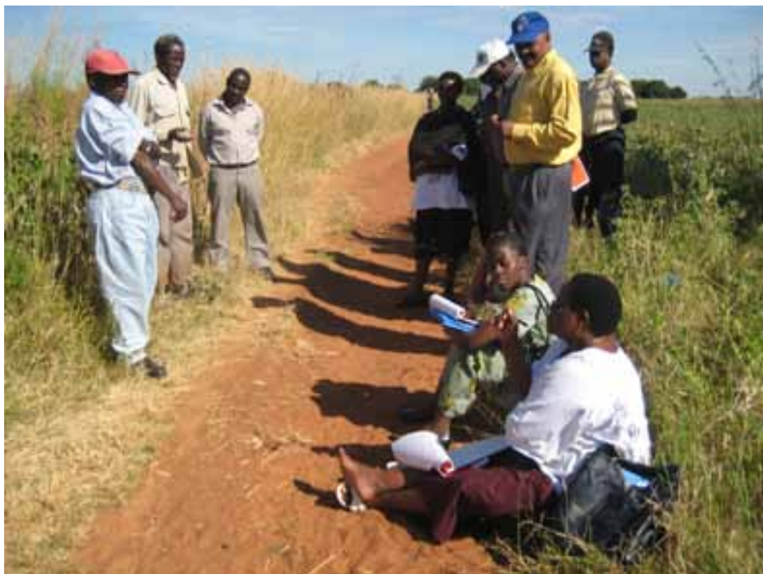
Tanzanian field training promoting integrated pest management (IPM) techniques in Moshi, Tanzania.