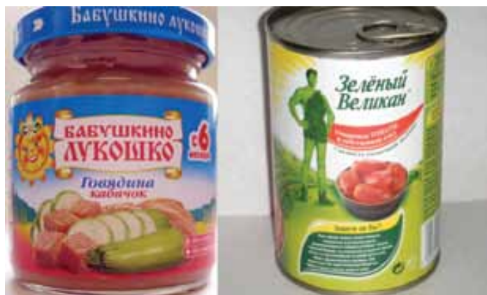
Chapaevsk Medical Association sampled foods for bisphenol A (BPA) finding the highest levels of BPA in baby foods and canned foods.

While numerous national level programs and projects were initiated in EECCA countries, general results to ensure chemical safety in the region still remain poor. The underlying causes are associated with uncoordinated activities of governmental agencies, their reluctance to share information and duplication of many efforts – all these factors hinder progress in addressing the problem. On the one hand, the case of the destroyed pesticide burial site in Armenia may be considered as a positive example – monitoring