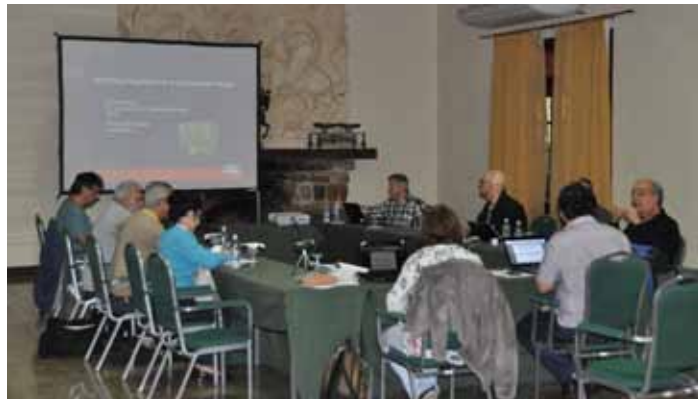
Brazilian NGO workshop, which established a Brazilian chemical safety/toxics-free NGO network with members from several provinces.

sheets as well as worker participation in commissions ensuring appropriate protection and accident prevention. It is worrisome that these conditions deteriorate above all in countries that adopt the so-called “flexibility measures” in labor contracting conditions, thus weakening the capacity of worker organizations and labor authorities to inspect and correct the problems.