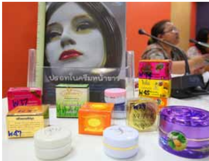
Press conference where the Foundation For Consumers and the Ecological Alert and Recovery-Thailand (Earth) released the results of their study of 47 different skin lightening creams that they tested for mercury in various markets in Thailand. 20% of the products contained mercury at levels above concern.