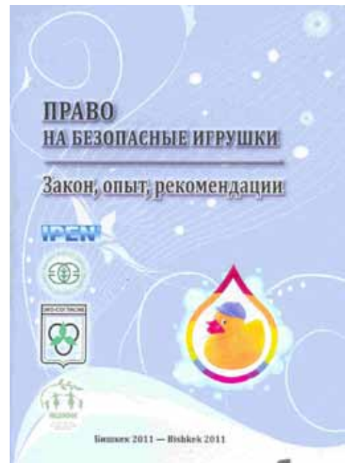
Chemicals in products booklet produced by Independent Ecological Expertise, Kyrgyzstan with other EECCA regional partners

The Statement was submitted to representatives of EECCA countries in the course of Environment for Europe Conference in September 2011. Notwithstanding the importance of the problem highlighted by NGOs, it is still not incorporated into the range of priorities of EECCA countries.