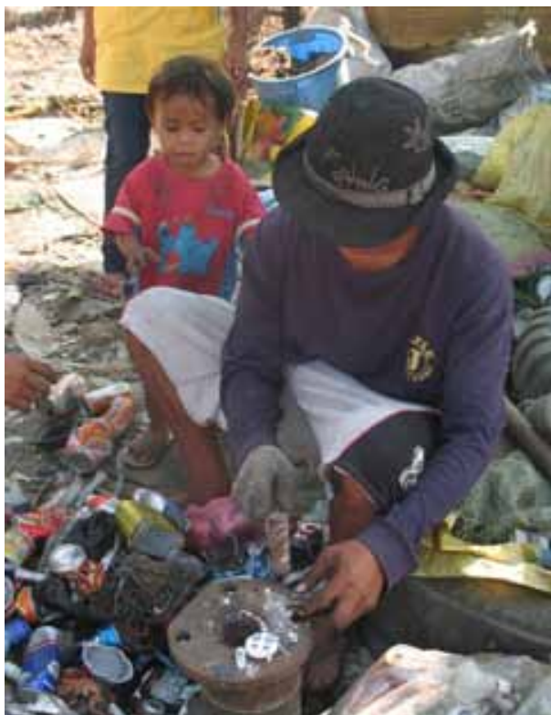
Informal recycler in the Philippines breaking apart a CFL (compact florescent light) bulb, as a young boy watches.