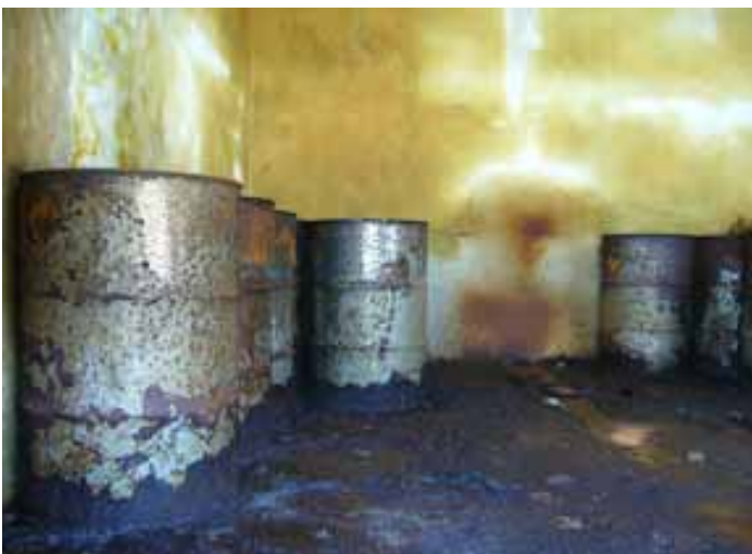
Aging pesticide storage, Durrës, Albania

According to experiences of NGOs from the CEE region, National SAICM Focal Points seem to be accessible. At the same time NGOs rarely contact them, as activities focused primarily and explicitly on SAICM implementation are not common in the region.