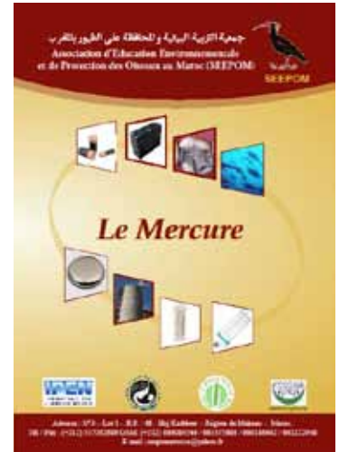
Mercury awareness flyer produced by SEEPOM, Morocco

There are, however, projects done by governments, such as a project that the Ministry of Environment in Lebanon carried out in 2011 under the name of “Demonstrating and Promoting Best Techniques and Practices for Reducing Health-Care Waste to Avoid Environmental Releases of Dioxins and Mercury.” The project aimed at demonstrating and promoting best practices and techniques for health-care waste management, evaluating commercially available, non-incineration healthcare waste treatment technologies, introducing and evaluating the use of mercury-free devices in model facilities, and establishing or enhancing training programs to build capacity for the implementation of best practices and technologies both within and beyond the model facilities and programs.