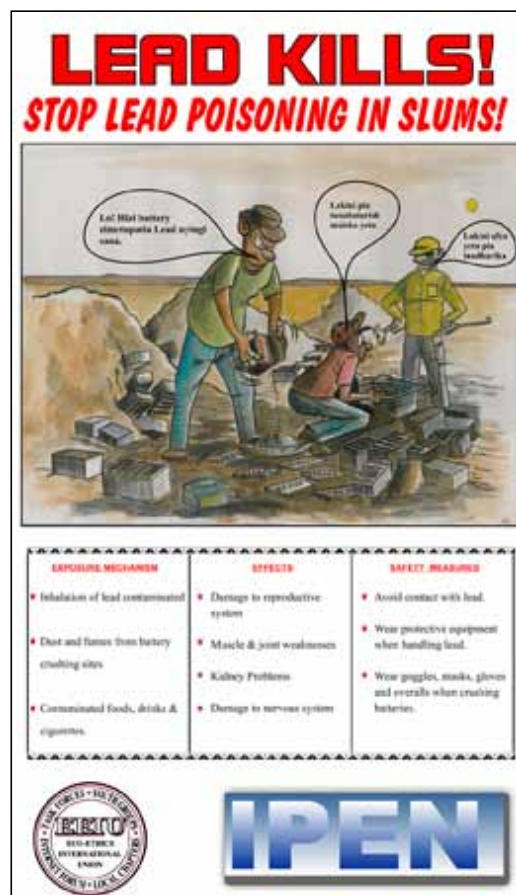
Poster raising awareness about the the dangers of improper lead battery recycling, produced by Eco-Ethics, Kenya, for slum areas around Mombasa where lead battery recycling is performed.