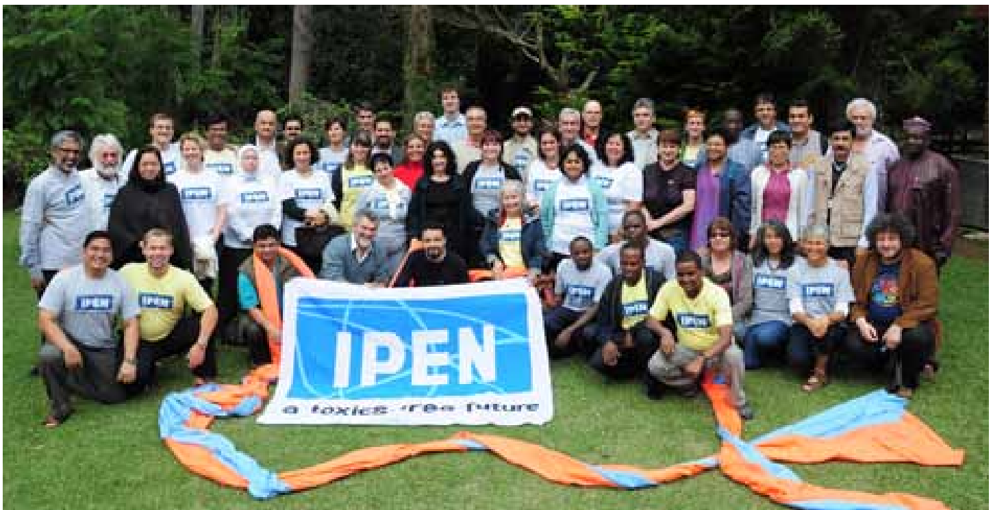
IPEN Global Meeting, Petropolis, Brazil June 2012

Despite some tangible advances, several serious concerns with SAICM implementation remain. In adopting SAICM, governments agreed that sound chemicals management requires a multisectoral and multistakeholder approach to chemical safety. However, in practice, SAICM is often considered to be an issue that is mainly the responsibility of the technical authorities in ministries of environment. As a result, the coordination between key government institutions is often unclear or non-existent. This problem is compounded by a frequent lack of sufficient budgets allocated to the chemical safety agenda, which comes from the relatively low rank chemicals occupy compared to other environmental issues such as climate change and biodiversity. Economic instruments that provide cost recovery from the chemical industry and earmark funds for chemicals management could be helpful but they are rare in developing and transition countries. No global agreement for cost internalization by the chemical industry has appeared, despite the large amount of money that could be available to governments for sound chemicals