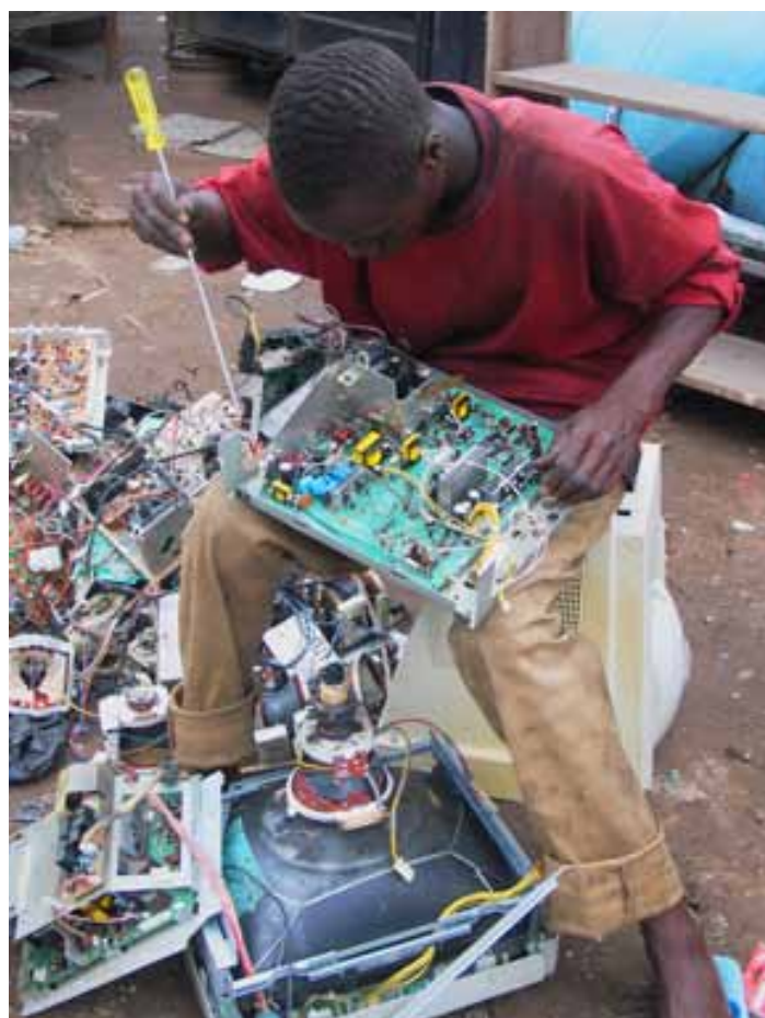
Nigerian e-waste recycler

The rapid growth of the electronics sector has accelerated the problems of managing both domestically generated and trans