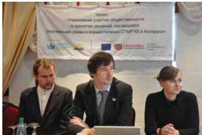
Center for Environmental Solutions, conducting a press conference in Minsk, Belarus to launch a chemical safety info center

Additionally, there are still double standards in chemical policy between EU and non-EU countries. The non-EU countries still