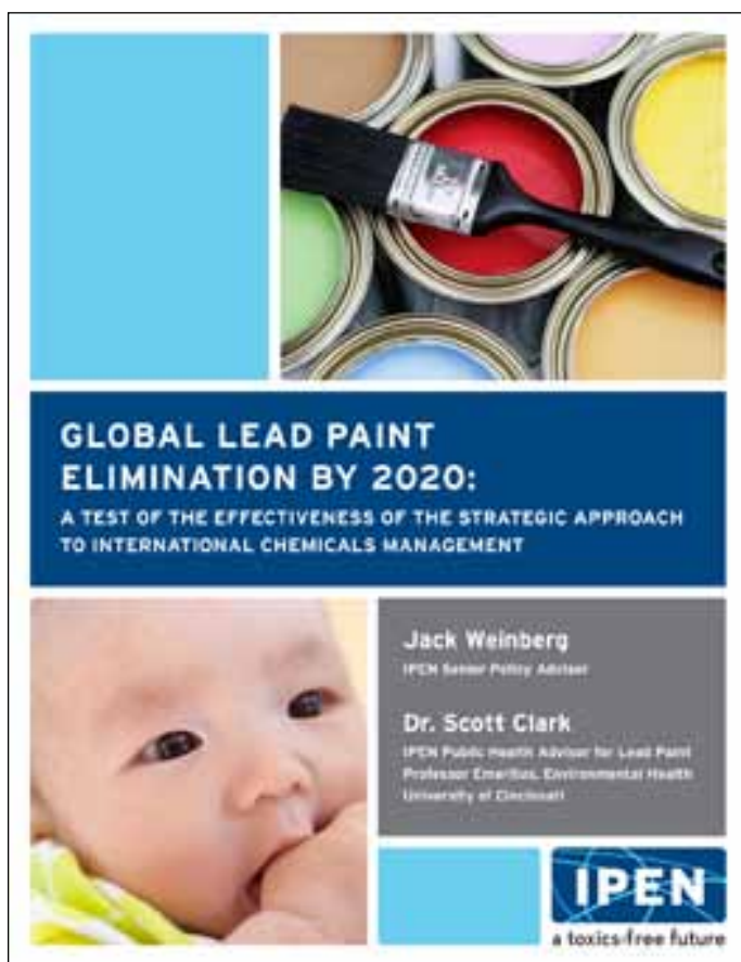
IPEN's 2012 global report on lead in paint

ICCM2 identified lead in paint as a SAICM emerging issue and invited UNEP and WHO to establish a global partnership to promote phasing out the use of lead in paints and to serve as the partnership's secretariat. 1 UNEP and WHO jointly initiated this