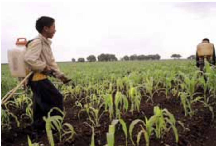
Children spraying pesticides in Mexico

Except for rare exceptions, there are no ongoing civil society participation structures capable of developing and carrying out SAICM activities with the participation of health and environmental protection organizations, consumers, and local social organizations.