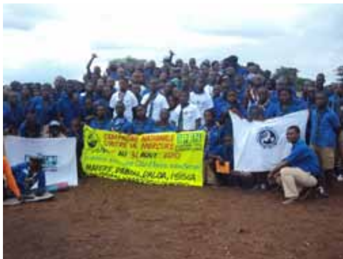
Youth awareness campaign about the threat of mercury exposure, conducted by Jeunes Volontaires pour l'Environnement Côte d'Ivoire (JVE)