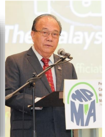
Keynote Address by YB Dato' Henry Sum Agong Deputy Minister, Ministry of Domestic Trade, Co-operatives and Consumerism